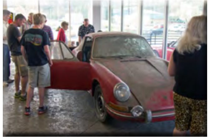
Members talk during the Tech Session.