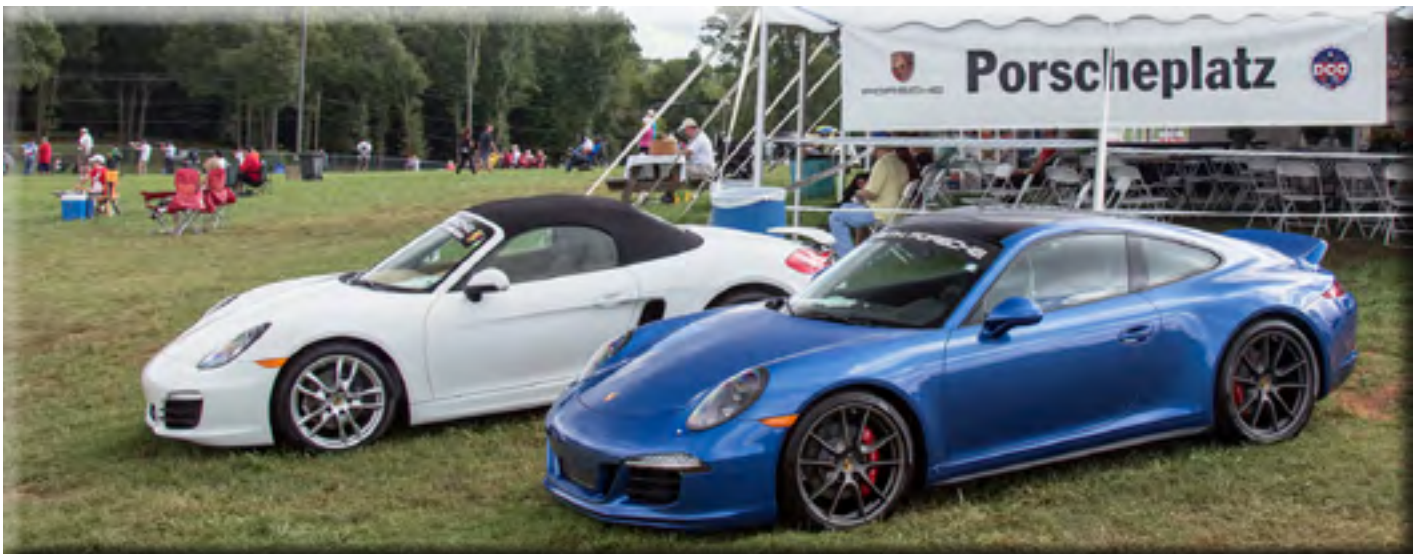
New Porsches outside the tent at VIR before the Tudor race.

for touring laps. Some said the speed on the track was too slow. But whatever the speed, touring laps are fun.