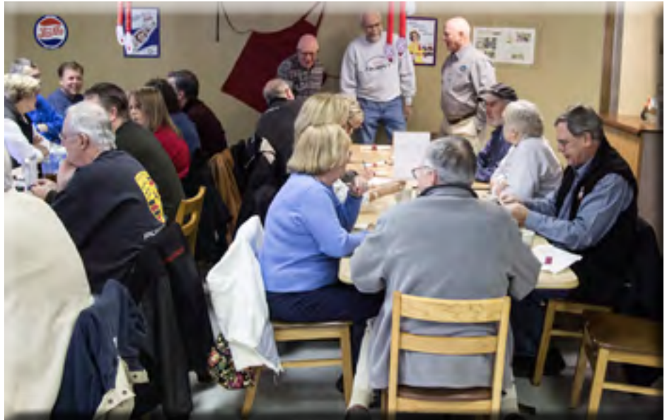
BRR members at Beverly's Country Kitchen for Cars 'n Coffee.

Cars 'n Coffee is our monthly casual social event. It is open not only to PCA members, but also to all Porsche owners, guests, and anyone willing to listen to us talk about our cars. Held at 9:30 AM each month in a different area within our region, it gives an opportunity for all members to meet and socialize. Weather permitting a lot of socializing happens in the parking lot before and after the brunch. These events usually have the largest attendance of our events with numbers ranging from 15-25 people. Dates & places are online.