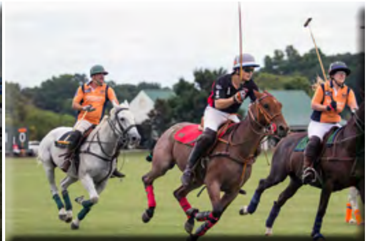
(L) Blue Ridge Region cars parked beside the polo field. (R) The polo match in progress (note the University of Virginia team in orange).